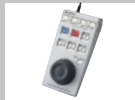
DSRM-20 Remote Control Unit