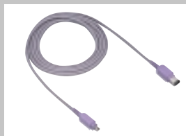
VMC-IL4615/4635 i.LINK Cable (4-pin to 6-pin)